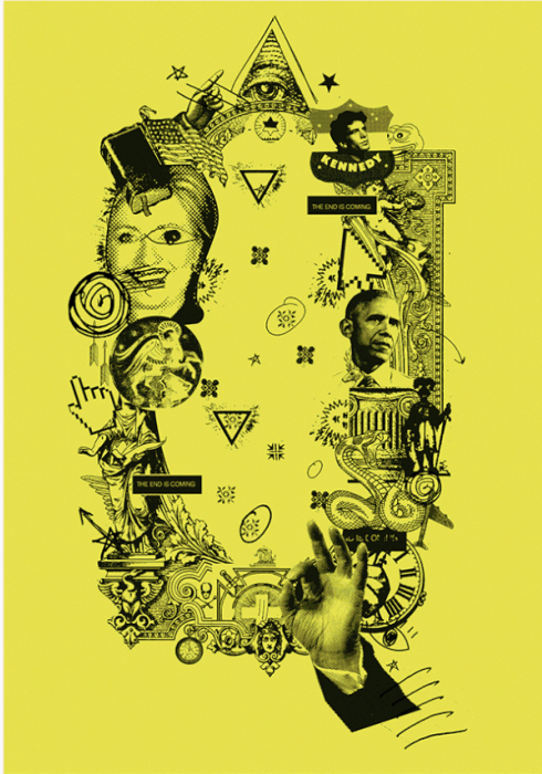
Illustration: Arsh Raziuddin; Ira Wyman / Getty; Evan El-Amin / Shutterstock; animation: Vishakha

In the final days before Congress passed a $2 trillion economic-relief package in late March, Democrats insisted on provisions that would make it easier for people to vote by mail, prompting Q himself to weigh in with dismay: “These people are sick! Nothing can stop what is coming. Nothing.”